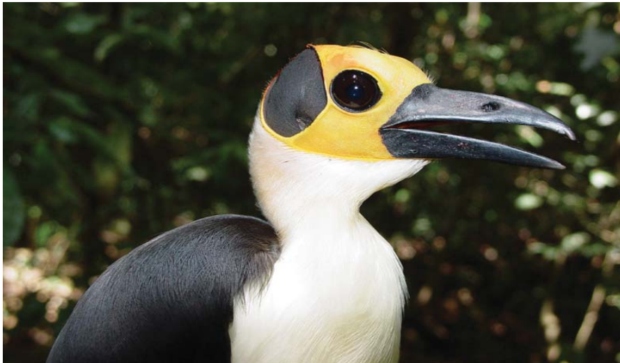
Figure 1. Picathartes gymnocephalus mist-netted in Ghana on 26 March 2003

On 14–30 March 2003 we conducted an avifaunal survey in a block of forest reserves in Brong-Ahafo Region. Our survey relied heavily on a line of 26 consecutively-strung mist-nets running along the boundary line between Ayum and Subim forest reserves (06°71'N, 02°73'W). The forest in this region is dominated by Celtis spp., Ceiba and Pterogota tree species and has many large boulders and rocky outcrops. On 26 March 2003 at 1040 h we mist-netted a P. gymnocephalus (Fig. 1), videotaped, photographed and released it unharmed. On 28 March 2003 we showed the video of the Picathartes to a local hunter in Asumura to discover whether he was familiar with the species. He immediately recognised the bird and told us that he had encountered at least three individuals in the nearby forest reserves. He reported some of the life history attributes of the species, such as breeding period (the fifth month of the year) and nest site. On 30 March he led us to a nest site. The nests were located on a boulder c.5 m high with a cave-like overhanging face sloping at a steep angle down to the ground. The two nests were constructed from mud and plant fibres, attached to the overhang with the cup of the nest forming a semi-circle c.30 cm wide, 15 cm high, and 15 cm deep. They were positioned less than 1 m apart at approximately the same height (c.2.5 m). On the floor of the shelter formed by the