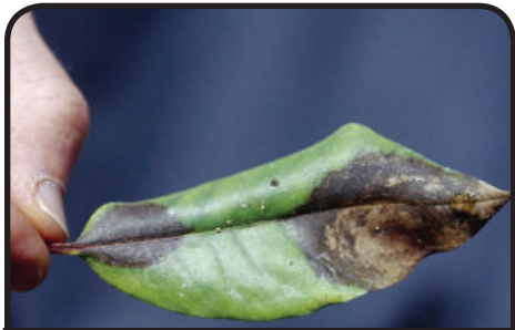
SUDDEN OAK DEATH ( Phytophthora ramorum )