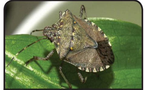
BROWN MARMORATED STINK BUG ( Halyomorpha halys)