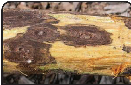
THOUSAND CANKERS DISEASE ( Geosmithia sp.)