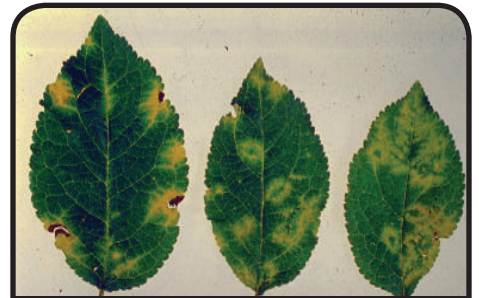
PLUM POX VIRUS ( Plum pox potyvirus )