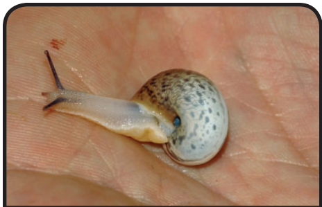
HELICID SNAILS ( Monacha cartusiana )