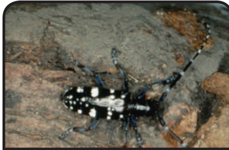
ASIAN LONGHORN BEETLE ( Anoplophora glabripennis)