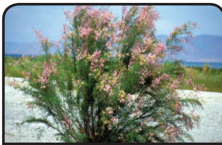
SALT CEDAR ( Tamarix ramosissima )