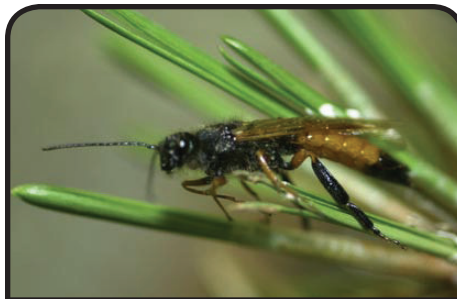
SIREX WOOD WASP ( Sirex noctilio )