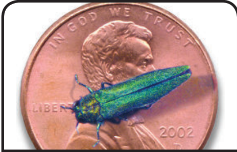
EMERALD ASH BORER ( Agrilus planipennis)

Your assistance in helping us find invasive pests is needed and appreciated. Please report suspected invasive plant pests to the Illinois Cooperative Agriculture Pest Survey Program at (217)-333-1005 or email : invasives@inhs.uiuc.edu