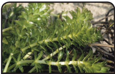
HYDRILLA ( Hydrilla verticillata )