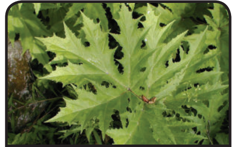
GIANT HOGWEED ( Heracleum mantegazzianum )

A primary objective of the Illinois Cooperative Agriculture Survey (CAPS) program is to safeguard our nation's food and environmental security from exotic pests that threaten our production and ecological systems. This program focuses domestic surveys for harmful or economically significant plant pests and weeds that have eluded first-line inspections at ports of entry.